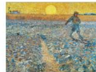
The Parable of the sower

Wistanstow School - Growing and Learning Together