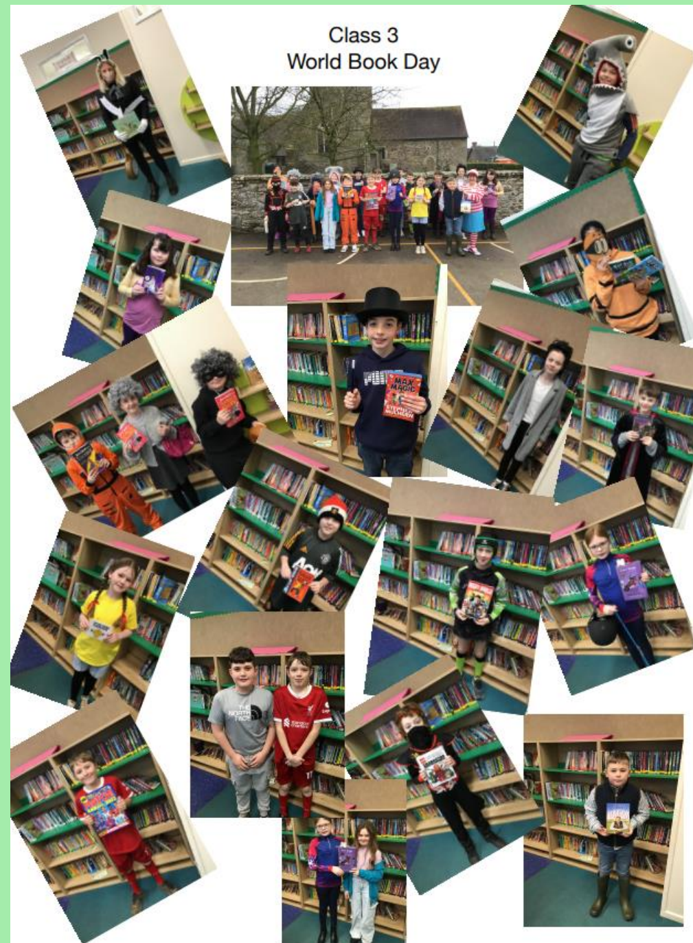
Class 3 World Book Day